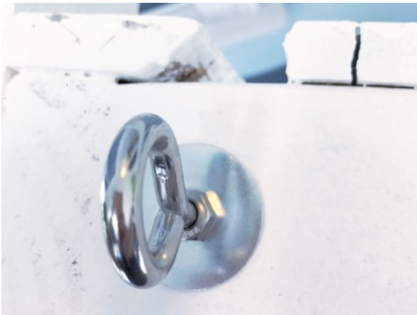
EXTERIOR WHERE QUICK LINK AND CHAIN MEET

For the hardware on the swing itself, you'll want to use the same drill bit to create a pilot hole on the 21" exterior of the swing base on each side. Use a washer as a guide to ensure the washers have room. Once the pilot holes are drilled, put a washer on your eye hook with the nut between the washer and hook, and screw in. You'll cap the eye bolt with a washer and Nylon lock nut on the interior underside of the swing. Repeat on the other side.